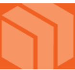
EXHIBIT A - SUPPORT SERVICES